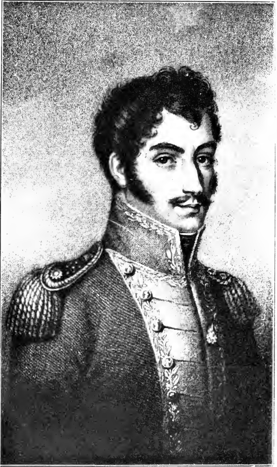
SIMON BOLIVAR The Liberator